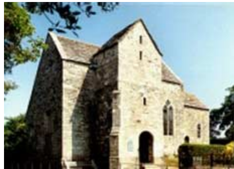
The Saxon church of St Martins, Wareham, Dorset

Whilst most churches were wooden, many were of stone and built in a distinctive style, often with a square tower.